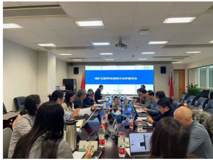
Attending the workshops on voluntary emission reduction methodology for coal mine methane

Kick-off Meeting for Methodology Preparation