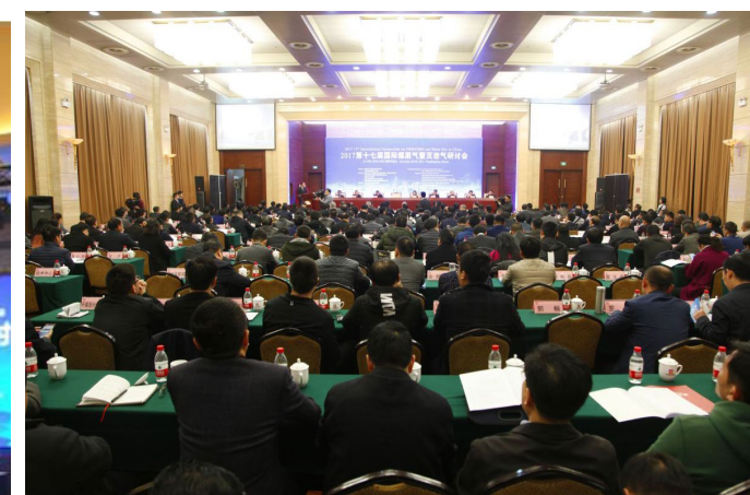
17<sup>th</sup> International Symposium on CBM/CMM in China held in Pingdingshan